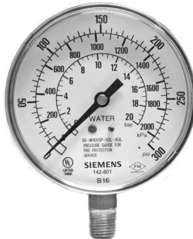
Part No: 142-801 Sprinkler Service Gauge