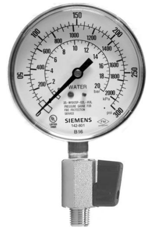
Appearance when units are installed together