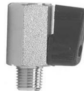
Part No: 142-851 Shut-off Ball Valve